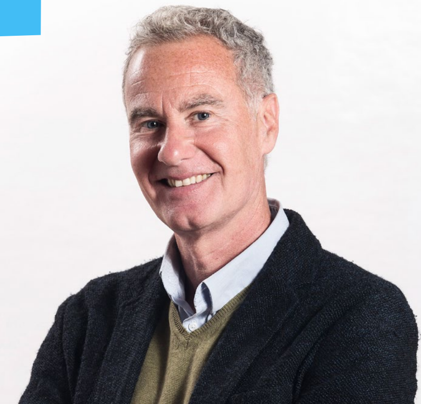
Programms Officer, Metropolis