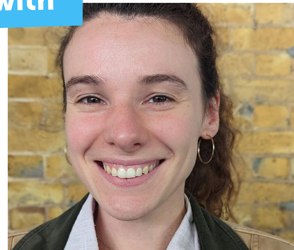
Programme Manager, World Habitat