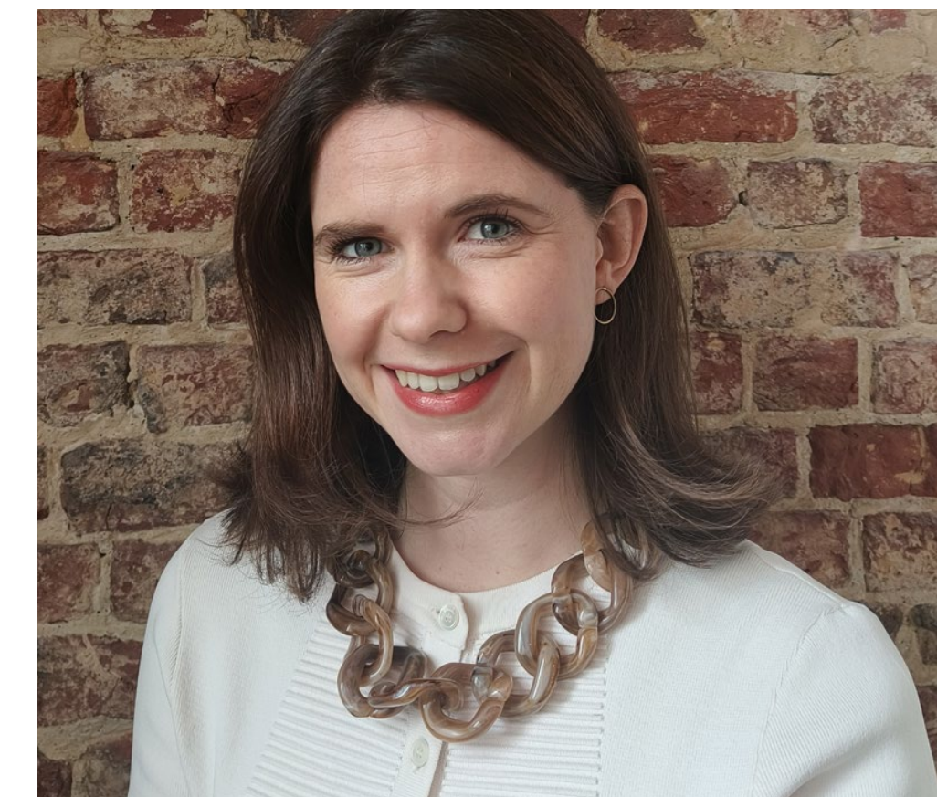
Head of Strategy and Development, European Community Land Trust Network