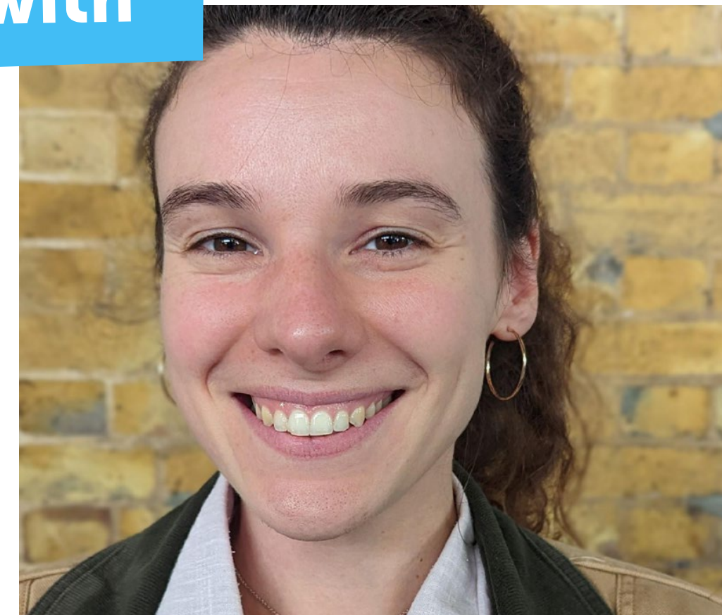
Programme Manager, World Habitat