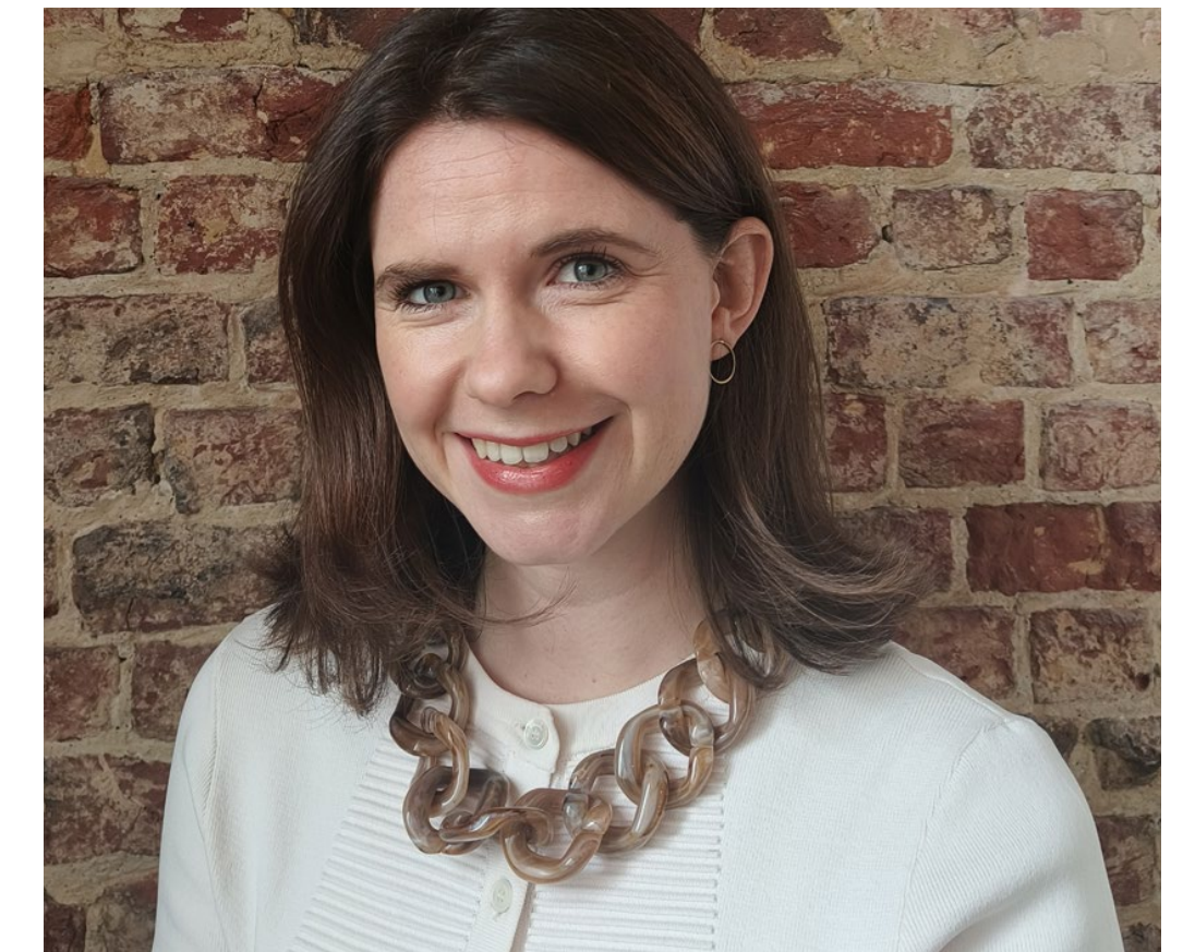
Head of Strategy and Development, European Community Land Trust Network